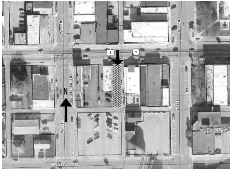
(MAP SOURCE: http://www.beacon.schneidercorp.com . Accessed September 2011)

The location of the resource is indicated.