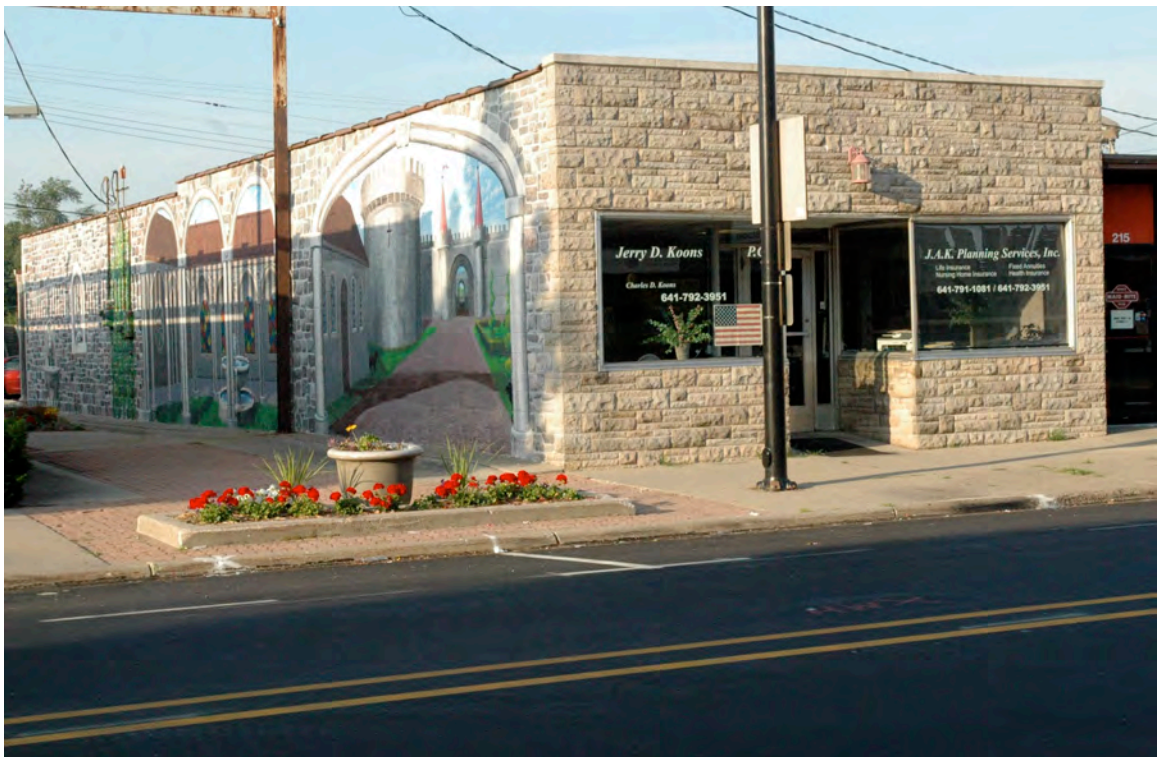
View of the resource, looking southwest across 1 st Ave. W.