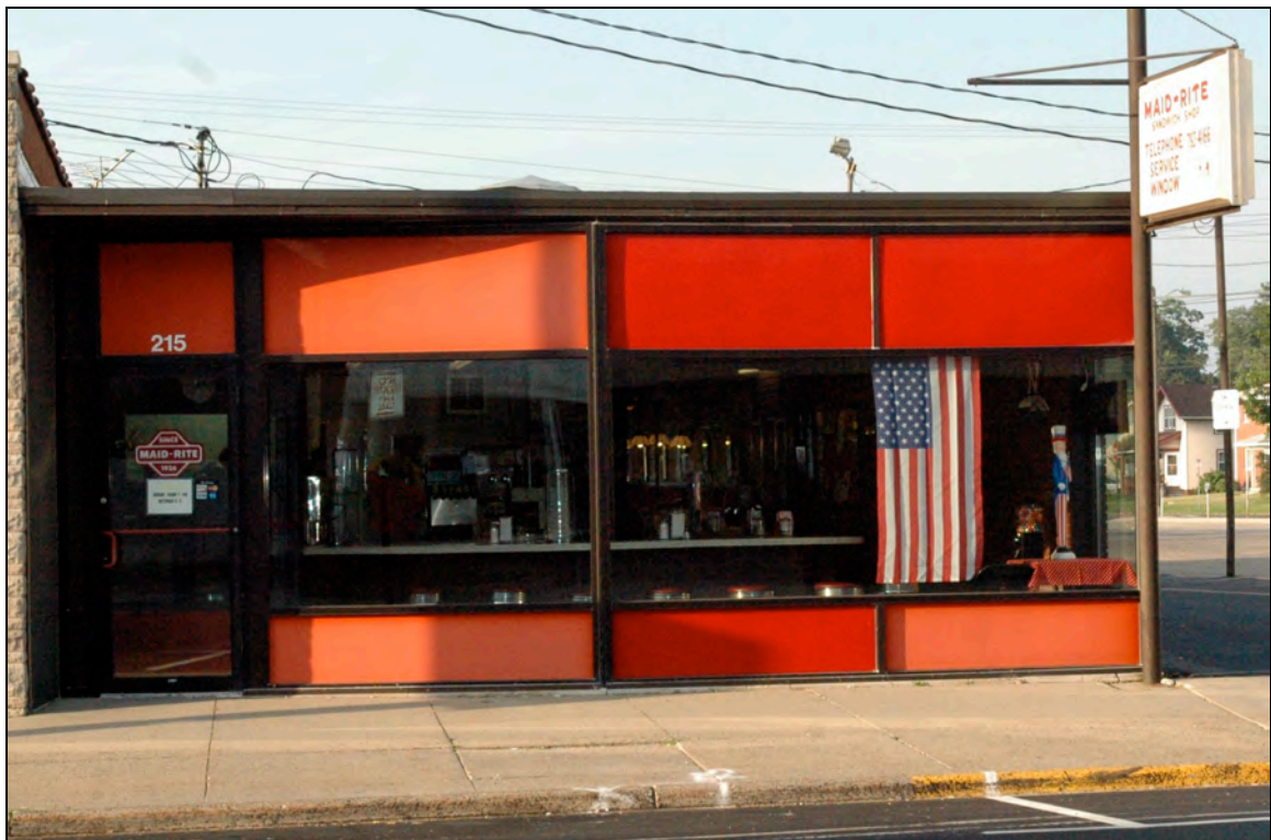
View of the resource, looking south across 1 st Ave. W.