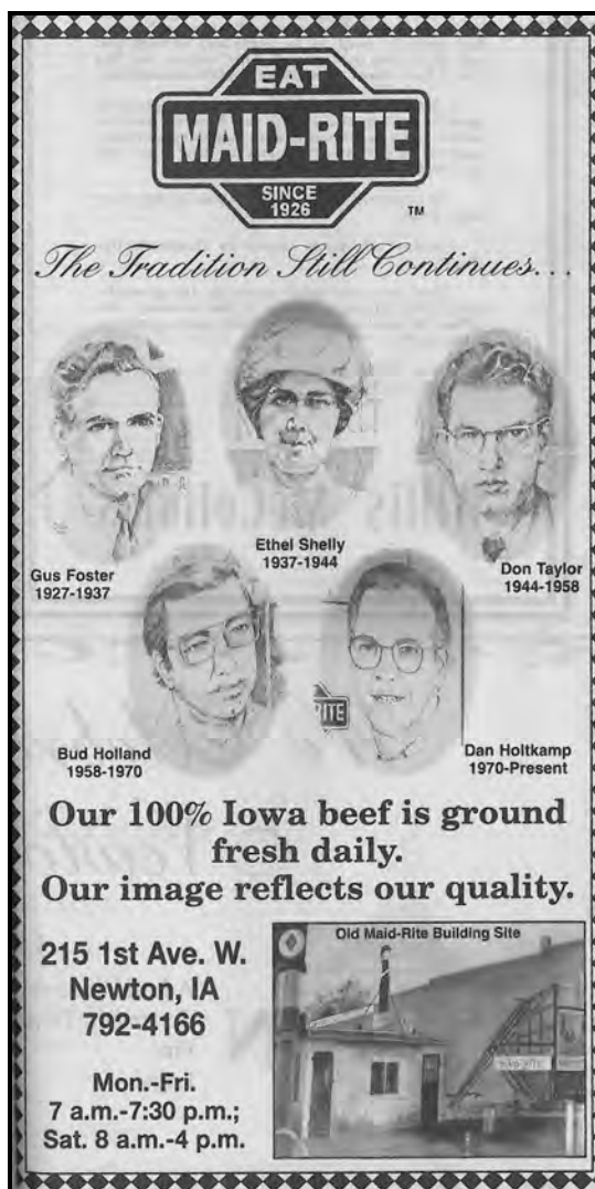
Maid Rite Ad, August 3, 2007

This advertisement shows the original Maid Rite Building and all owners through 2012.